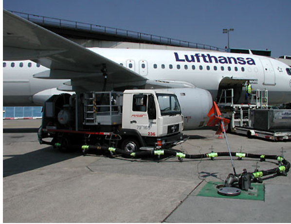
Hydrant fuel dispenser connected to the fuelling point under an aircraft's wing.

TraceTek Leak Detection and Locating Systems can monitor miles of single wall buried pipelines for fuel leaks, provide a precise location of a small developing leak, close valves before it becomes catastrophic, and interface with a pipeline monitoring control center for notification.