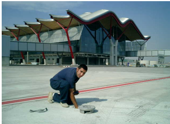
Inspection of the TT5000 Sensing Cable can easily be performed from the access ports at any section of the 20 km TraceTek Leak Detection System installed at the Madrid Airport in Spain.

TraceTek TT5000 Sensing Cable installed inside slotted PVC conduit along side a single wall buried hydrant pipeline can detect a small fuel leak and identify the location with pinpoint accuracy. Traces of any fuel leakage are drawn into the conduit by capillary action and contact the sensing cable for detection and location of the leak.