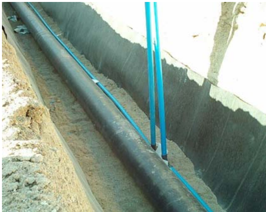
Schedule 80 PVC slotted conduit installed along side a hydrant fuel distribution pipeline below an airport parking apron.