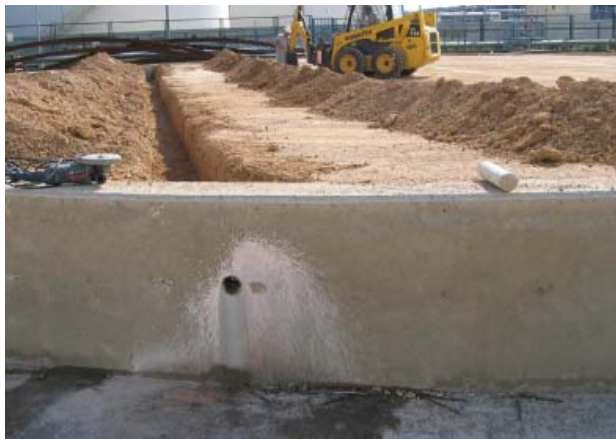
Trenches are created in the backfill for the slotted PVC conduit to be positioned and a hole is formed in the ring wall

TraceTek TT5000 Sensing Cable installed inside rows of slotted PVC conduit below a storage tank can detect a small fuel leak and provide a warning alert signal of a tank containment failure. Traces of any fuel leakage are drawn into the conduit by capillary action and contact the sensing cable for detection of the leak. TT5000 lines are typically spaced at 4.5 or 6 meter intervals.