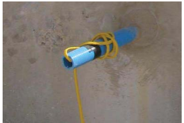
Slotted PVC conduit with a pull rope ready for the installation of the TT5000 sensing cable

TraceTek Leak Detection Systems can monitor single steel-floor storage tanks for fuel leaks in Hazardous Areas at a low install and commission cost, with no system integration requirements. A simple visual leak indicator module begins to flash when the sensing cable detects a small developing leak.