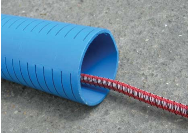
TT5000 sensing cable installed within a slotted PVC conduit