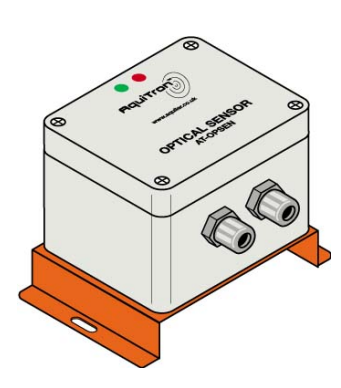
Floor, trench, sump or pit mounted AT-OPSEN

Level switches are suitable for high, low or intermediate level detection in practically any tank, large or small. Installation is simple and quick through the tank top, bottom or side. Solid state-switching ensures dependability over long service life. The sensor offers ±1mm repeatability and broad liquid compatibility. They are not recommended for use in any liquid that crystallizes or leaves a solid residue.